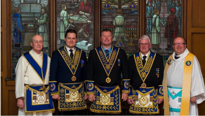
Three District Deputies and Officers outside the Norman E. Byrne Cathedral at the Divine Service