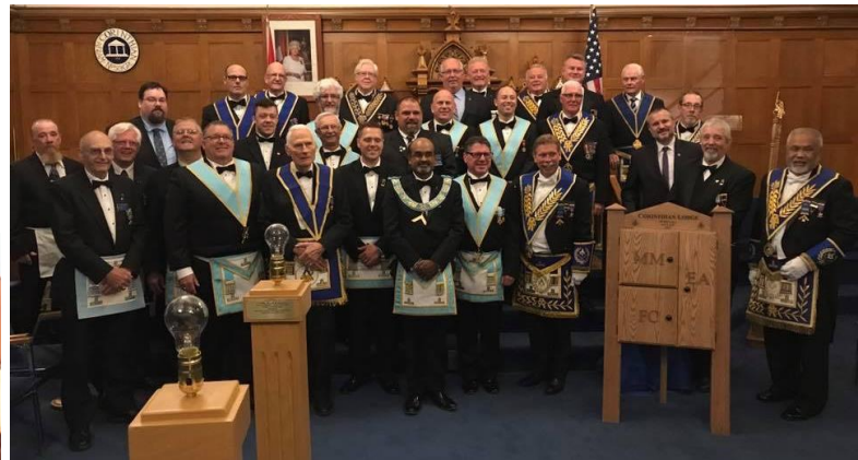
Corinthian Lodge No. 513