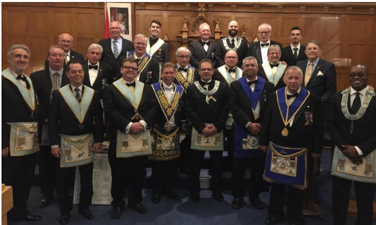
Temple Lodge No. 324