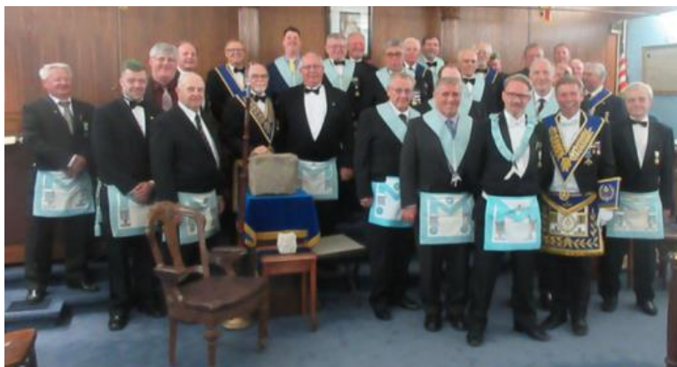
Meridian Lodge No. 687