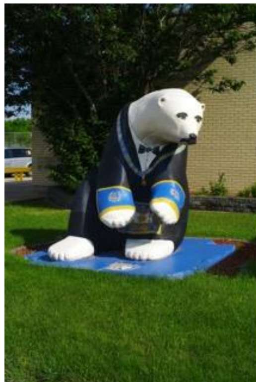
Looking for a Ride to Grand Lodge!