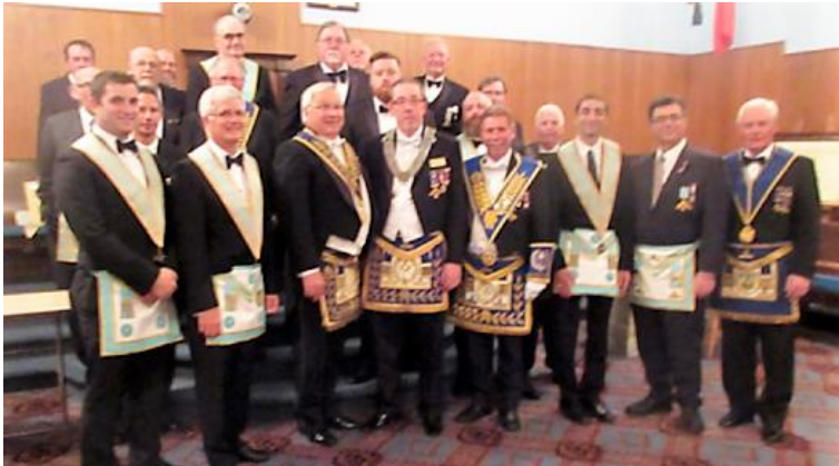
Valley Lodge No. 100