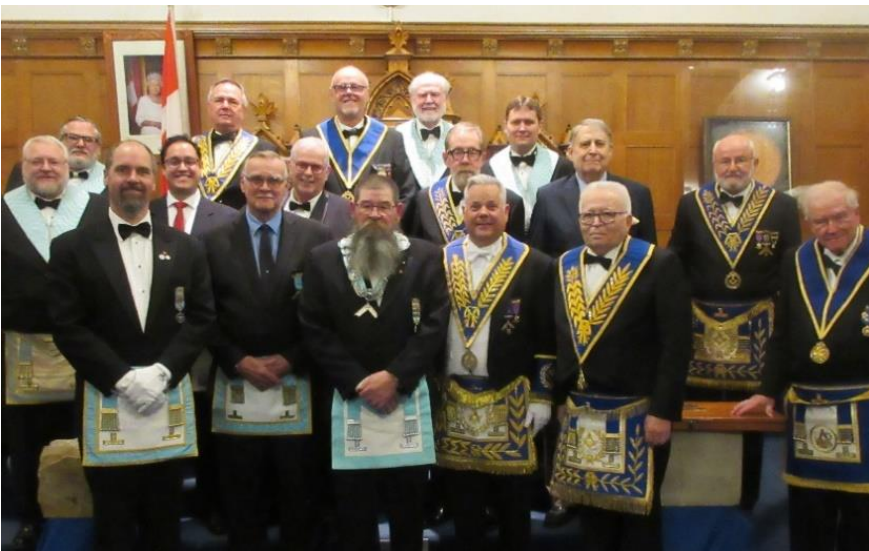
Ancient Landmarks / Doric Lodge No. 654