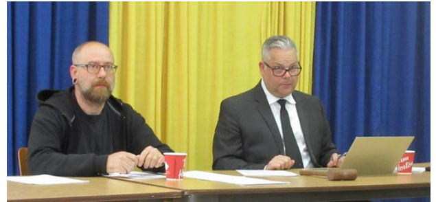
District C Spring Meeting May 27 2023