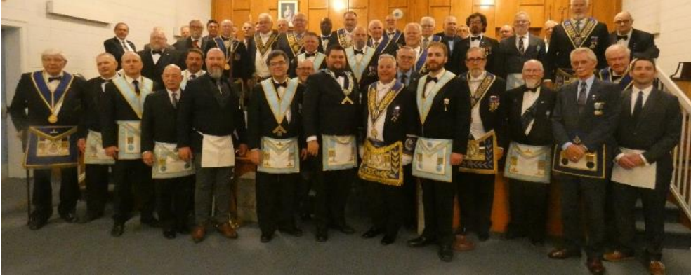
The Electric Lodge No. 495