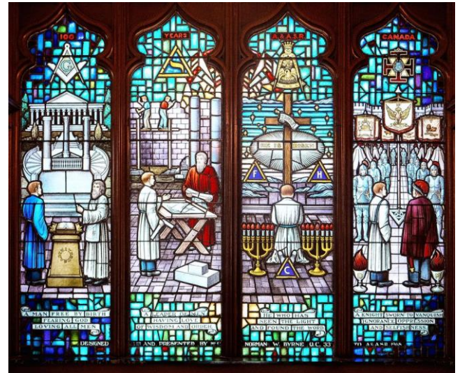
Craft Lodge Lodge of Perfection, Chapter of Rose Croix Consistory.