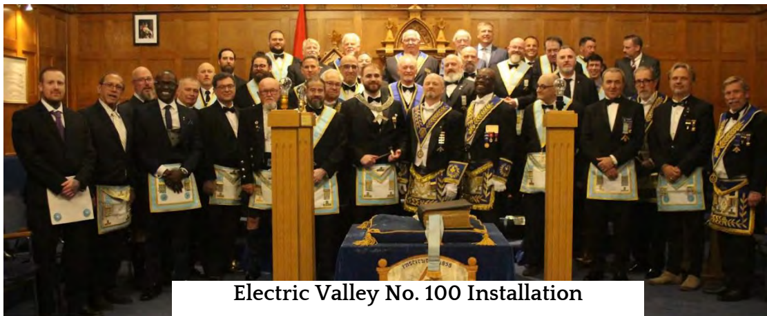
Electric Valley No. 100 Installation