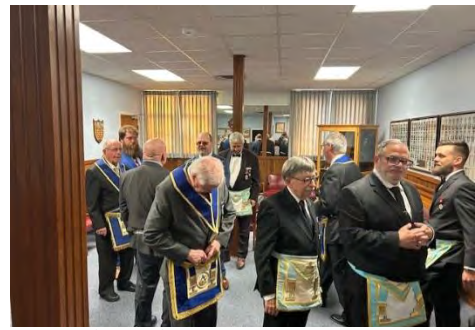
Getting ready in the anteroom at Victoria Lodge