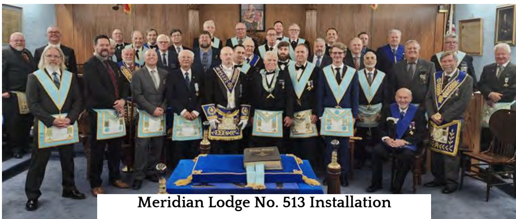
Meridian Lodge No. 513 Installation