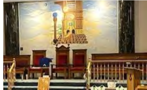
Beautiful Mural and Throne in the East